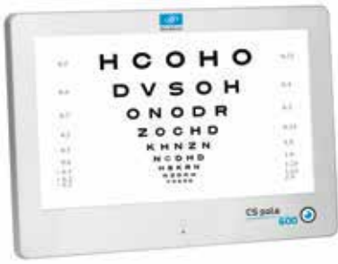
CS POLA 600