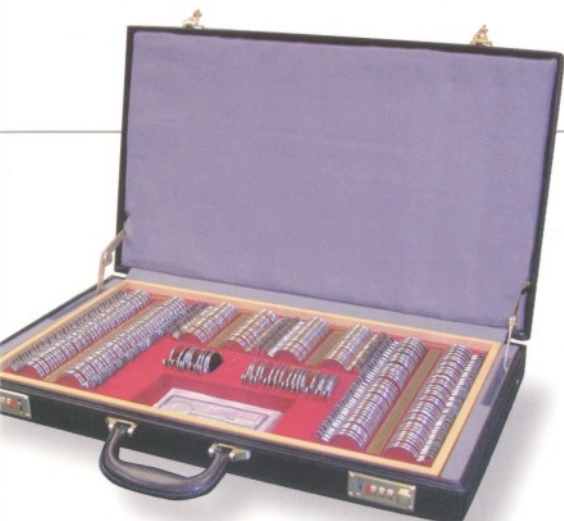
Carrying Case is standard with the Full Diameter Trial Lens Set