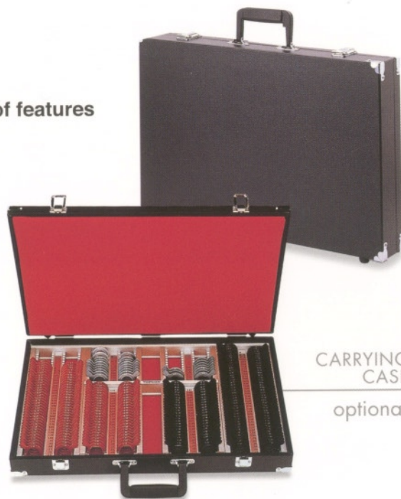
CARRYING CASE optional

The Corrective Curve Trial Lens Set comes in a sturdy holding tray with beveled slots for fast and easy insertion. The Deluxe Set includes minus and plus spherical lenses, prisms, other accessory lenses and various cylinder power lenses.